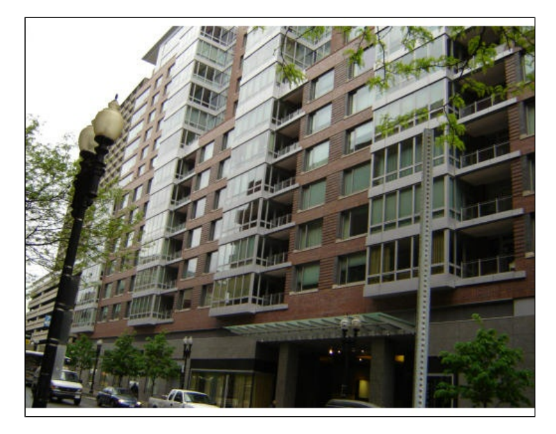
The information in this listing was gathered from third party sources including the seller and public records. MLS Property Information Network and its subscribers disclaim any and all representations or warranties as to the accuracy of this information. Content ©2007 MLS Property Information Network, Inc.