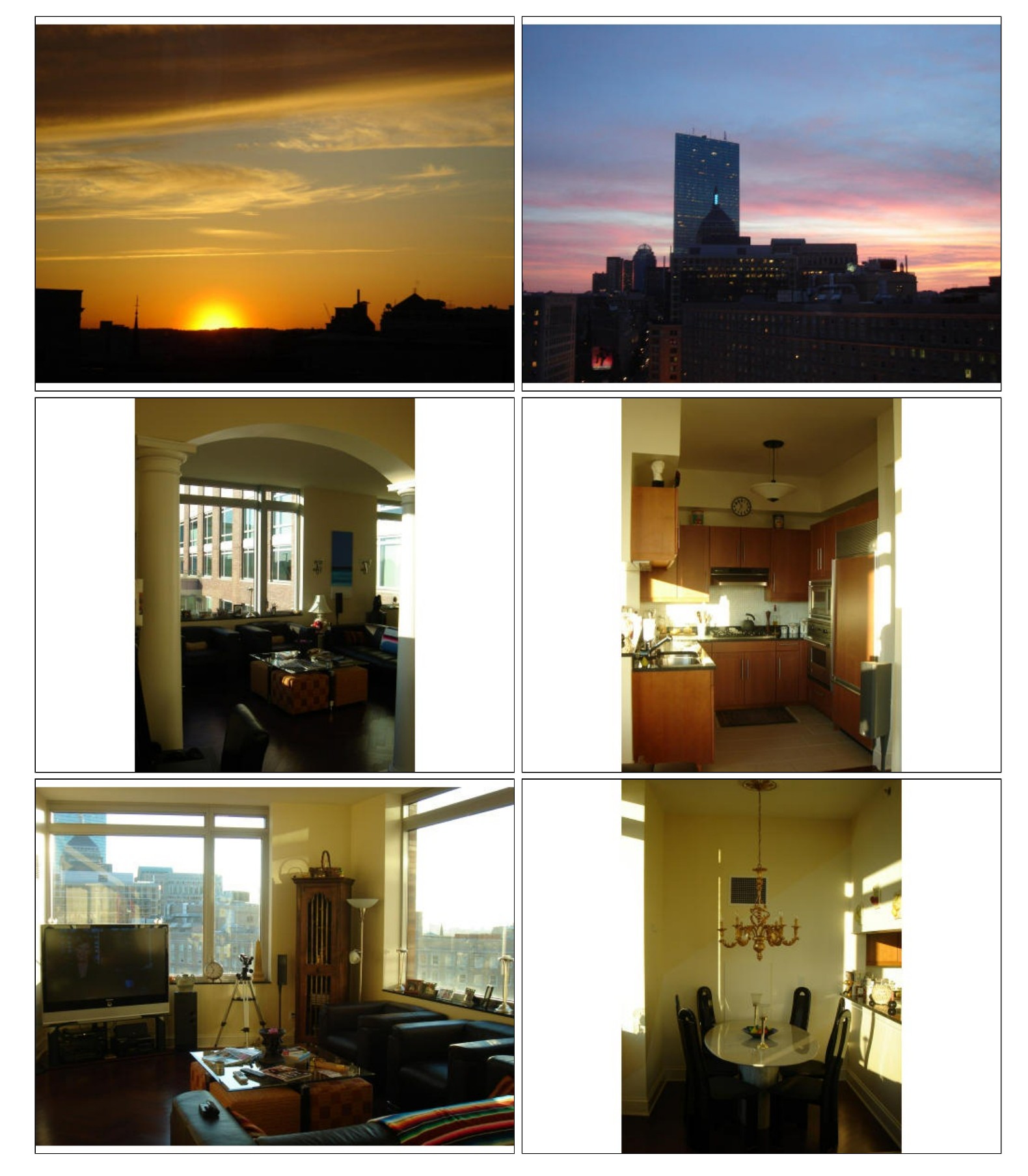
The information in this listing was gathered from third party sources including the seller and public records. MLS Property Information Network and its subscribers disclaim any and all representations or warranties as to the accuracy of this information. Content ©2007 MLS Property Information Network, Inc.