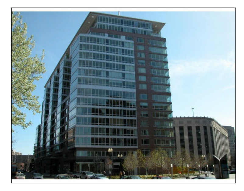
The information in this listing was gathered from third party sources including the seller and public records. MLS Property Information Network and its subscribers disclaim any and all representations or warranties as to the accuracy of this information. Content ©2007 MLS Property Information Network, Inc.