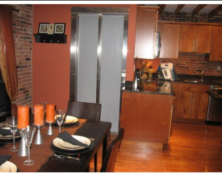
The information in this listing was gathered from third party sources including the seller and public records. MLS Property Information Network and its subscribers disclaim any and all representations or warranties as to the accuracy of this information. Content ©2007 MLS Property Information Network, Inc.