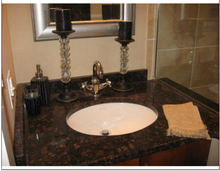
The information in this listing was gathered from third party sources including the seller and public records. MLS Property Information Network and its subscribers disclaim any and all representations or warranties as to the accuracy of this information. Content ©2007 MLS Property Information Network, Inc.