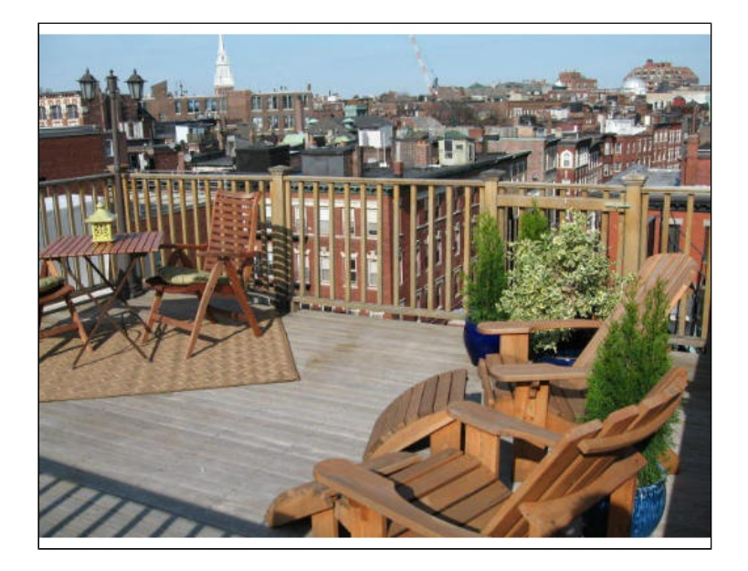
The information in this listing was gathered from third party sources including the seller and public records. MLS Property Information Network and its subscribers disclaim any and all representations or warranties as to the accuracy of this information. Content ©2007 MLS Property Information Network, Inc.