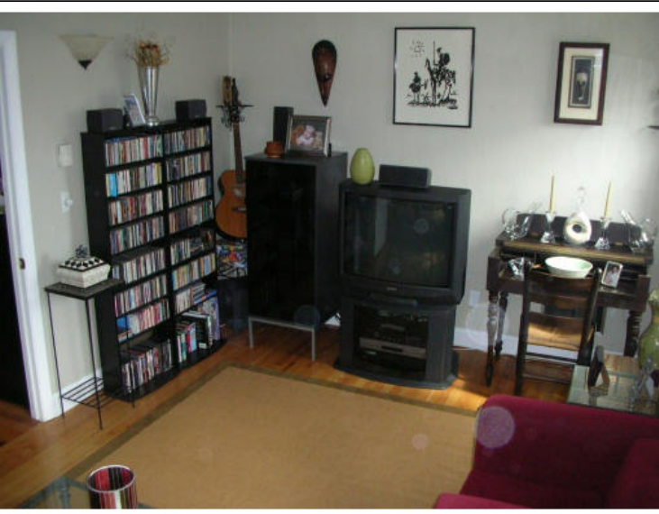
The information in this listing was gathered from third party sources including the seller and public records. MLS Property Information Network and its subscribers disclaim any and all representations or warranties as to the accuracy of this information. Content ©2007 MLS Property Information Network, Inc.